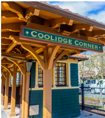
Coolidge Corner T Stop