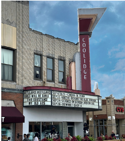
Coolidge Corner Theatre