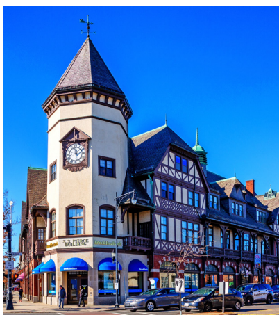
S.S. Pierce Building

★ Brookline Coolidge Corner Communities 1443 Beacon Street, Brookline