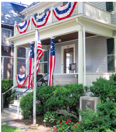
John Fitzgerald Kennedy National Historic Site