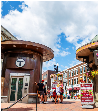
The Heart of Harvard Square