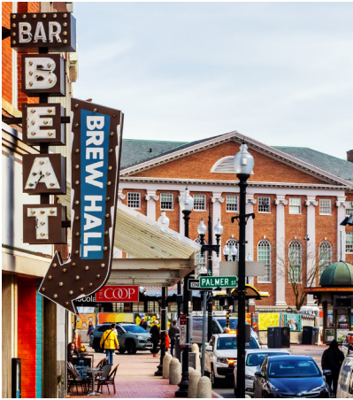
Brattle and JFK Street Crossing