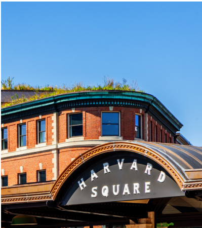
Harvard Square Kiosk