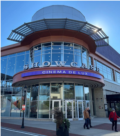
Showcase Cinema de Lux