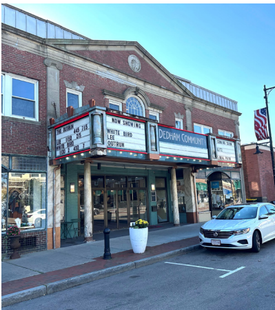
Dedham Community Theatre