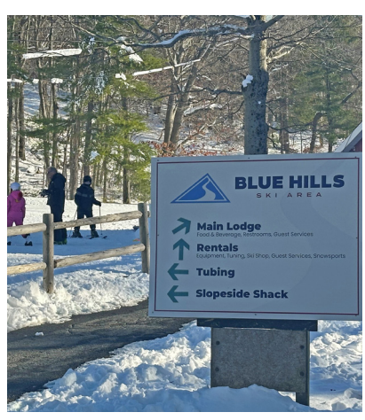
Blue Hills Reservation / Ski Area