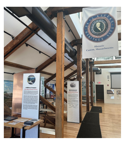
Paul Revere Heritage Site