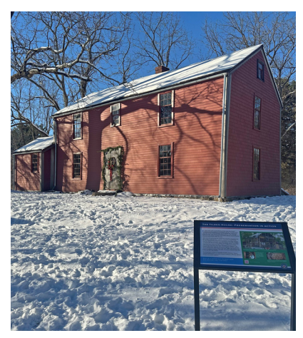
The Tilden House