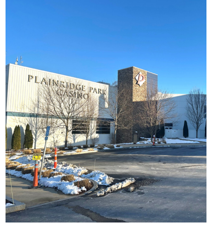
Plainridge Park Casino