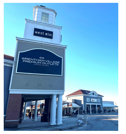
Wrentham Premium Outlets