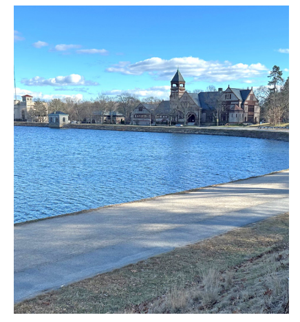
Chestnut Hill Reservoir