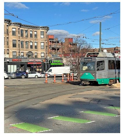
Center of Cleveland Circle/ Green Line Trolley