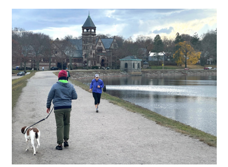
Chestnut Hill Reservoir

With its ideal location on the border of Brookline and Boston, Cleveland Circle's quieter neighborhoods and easy access into Boston make this a gem of a community.