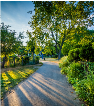
Back Bay/Fens Walkway