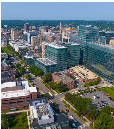
Longwood Medical Area