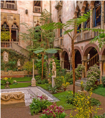
Isabella Stewart Gardner Museum